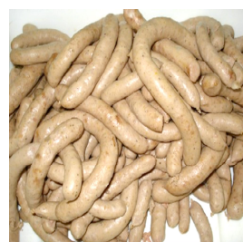
Goat Meat Sausage