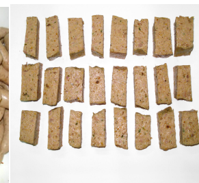
Goat Meat Nuggets