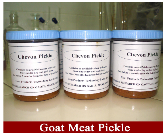
Goat Meat Pickle