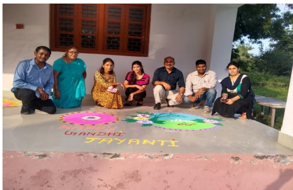
Judges and participants