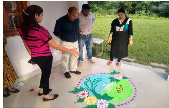
Judges interacting with participants