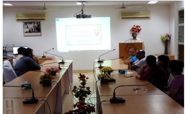
Extempore competition for staff