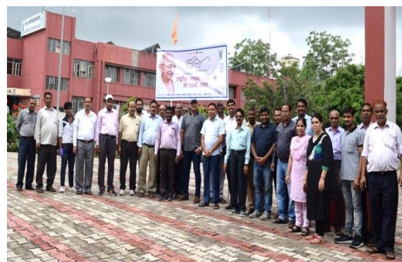
Glimpses of Swachhta campaign and plastic awareness