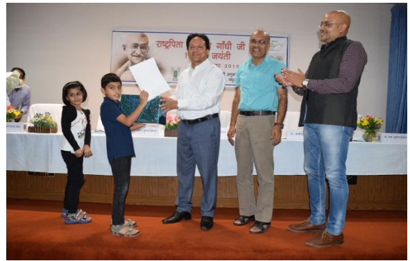
Glimpses Celebration of 150 th Birth Anniversary on 2 nd October, 2019