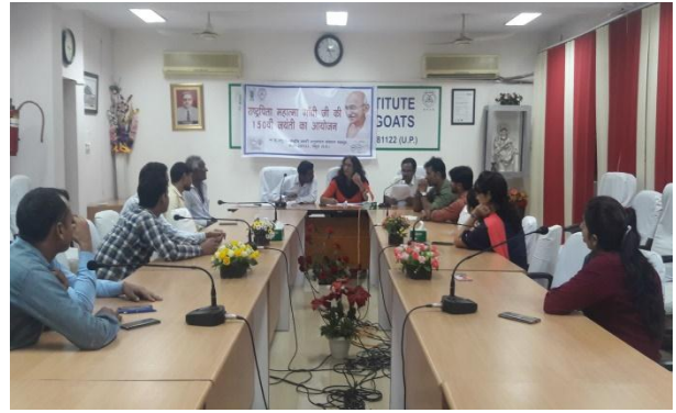
Quiz competition for staff