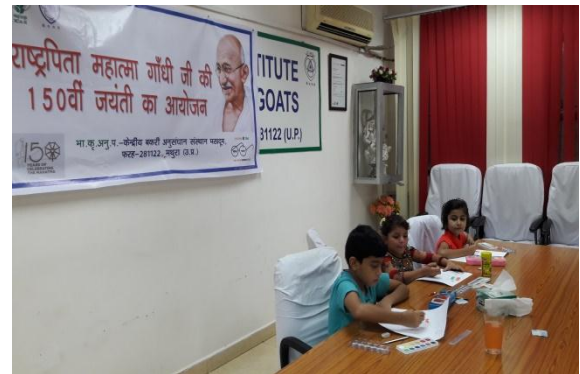
Painting competition for school children